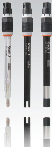
Memosens Sensors pH, Cond, Oxy, Temp