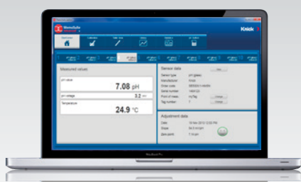
MemoSuite Software tool for calibration, sensor diagnostics and database documentation