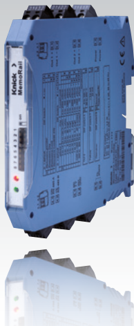
MemoRail Digital analyzer for Memosens sensors